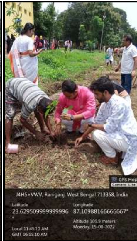
Mahogany saplings were planted in the college on the Independence Day on the occasion of Azadi Ka Amrit Mahotsav