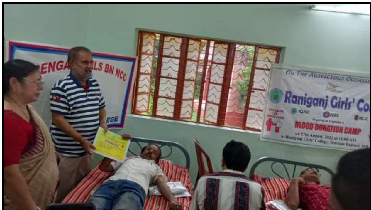
Blood Donation organized on 27 th August 2022 on the auspicious occasion of Azadi Ka Amrit Mahotsav